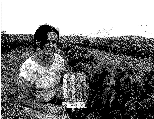
Table of Contents Photos: Agrinos Microbial Crop Input Production Facility in USA Coffee Grower in Brazil