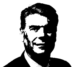
Chairman of the Board and Chief Executive Officer, Baxter International Inc.