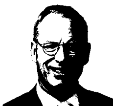
Lead Independent Director, Walgreens Boots Alliance, Inc. Former Chairman and Chief Executive Officer, USG Corporation