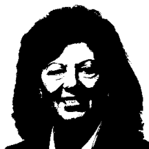
Former President and Chief Executive Officer, Amylin Pharmaceuticals