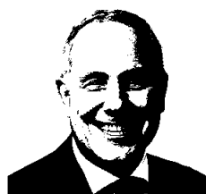
Chairman, Health Evolution Partners