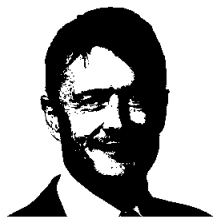
Co-Head of UK Investments, CVC Capital Partners