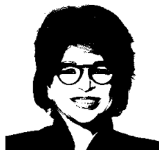
Former Senior Advisor to President Barack Obama