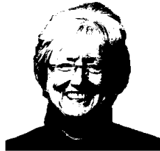
Former Chief Executive Officer, Henry Ford Health System