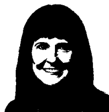
Former Managing Partner, Ernst & Young LLP