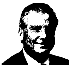
Senior Advisor, Sycamore Partners