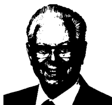
Executive Vice Chairman and Chief Executive Officer, Walgreens Boots Alliance, Inc.