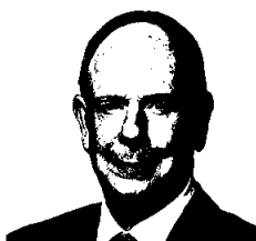
Executive Chairman, Walgreens Boots Alliance, Inc.