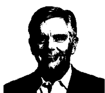
H. Lawrence Culp, Jr. Chairman and CEO, GE; CEO, GE Aerospace