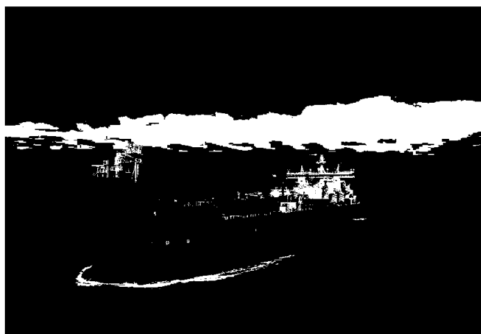
M/T “Sindre Knutsen”