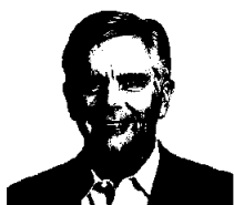
H. Lawrence Culp, Jr. Chairman and CEO, GE; CEO, GE Aerospace