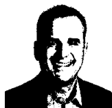
Peter J. Arduini

President and Chief Executive Officer, GE HealthCare